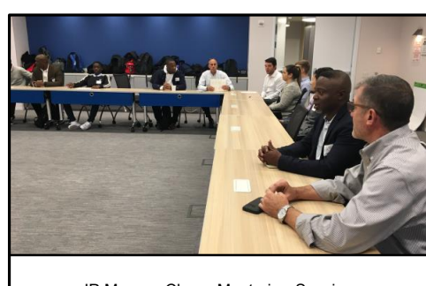
JP Morgan Chase Mentoring Session.